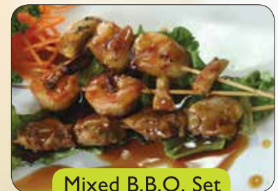
Mixed B.B.Q. Set